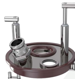
VAPOR RECOVERY COVERS